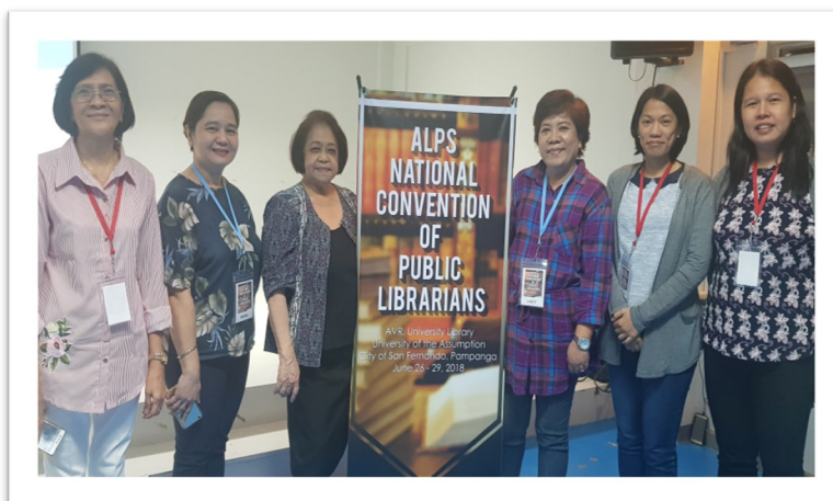
QCPL participants with Hon. Lourdes T. David, Chair of the CPD Council.

This convention was different from other conventions conducted in the past. The organizers ensured to incorporate workshops at the end of each lecture, wherein everybody participated in the formulation of groups' proposals and innovations which could be replicated or implemented in their respective libraries.