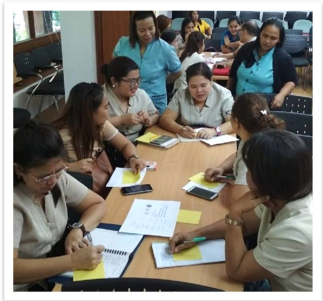
Group participants during their sharing of experiences on PRB