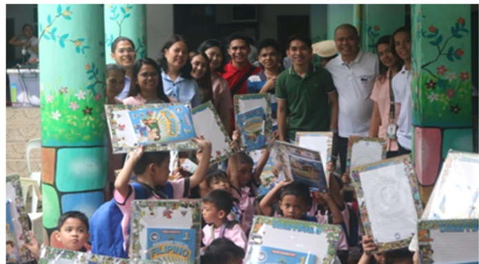
QCPL staff, KNLES teachers, KNL Barangay Officials and students holding Smartbooks