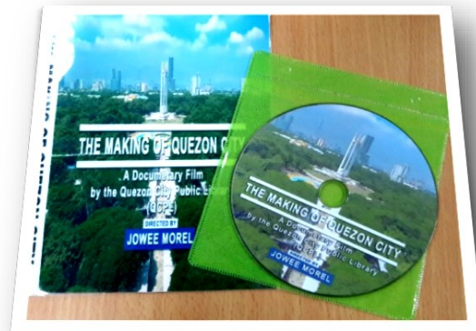
CD on the documentary film, entitled “The Making of Quezon City”