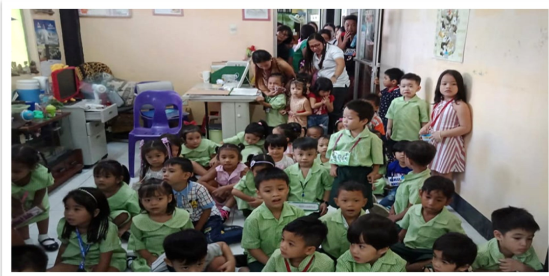
Day Care pupils waiting eagerly for their Smart books after the Orientation and Puppet show at Escopa 3 Branch of the Quezon City Public Library.

For years, the Escopa 3 Library, a branch of the Quezon City Public Library has been serving the educational and recreational needs of the children of the community.