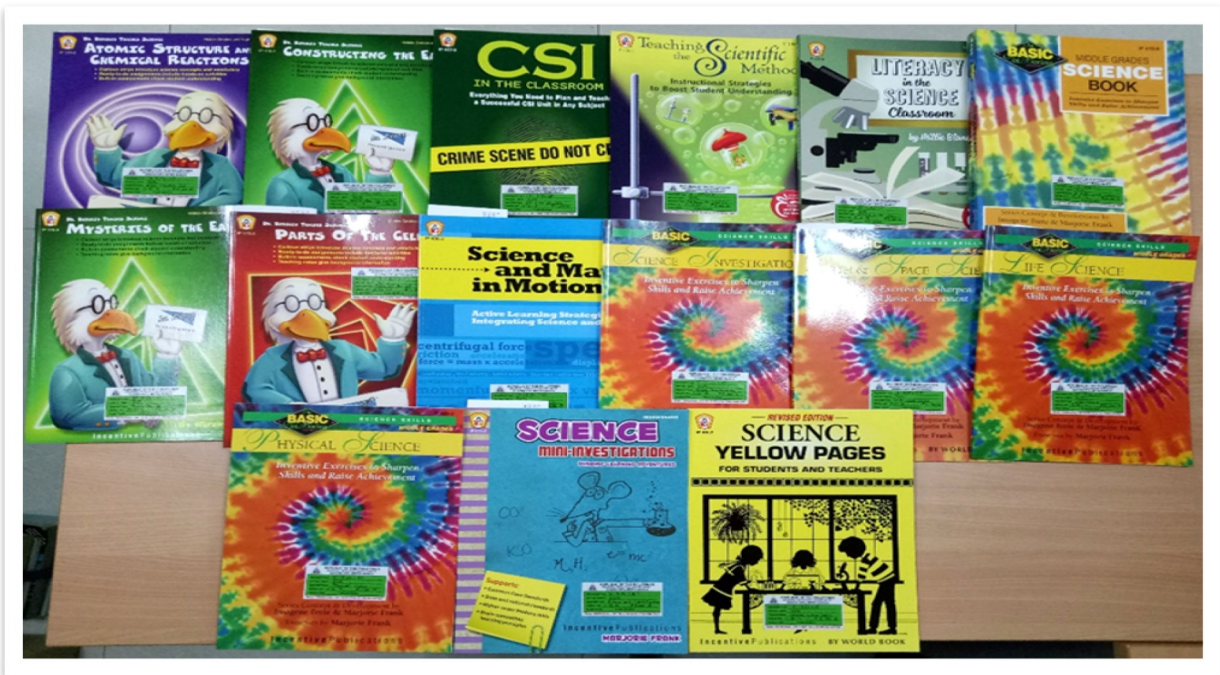
Mathematics, Sciences books

The books are currently in process and will be distributed to different QCPL branches at the end of September 2018.