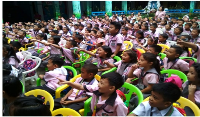
KNLES Kindergarten students