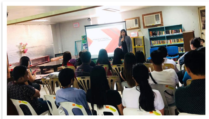
A Front row International representative giving talk on business opportunity seminar.

This seminar was attended and participated by community residents, business clientele, students and the library staffs who were interested in venturing in some kind of profitable business.