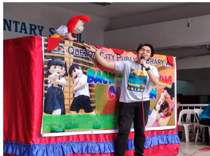
Puppet Chuchay and Kuya Reigel during the puppet show.