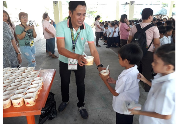
Distribution of foods during the feeding program on Nutrition Month Campaign

July is National Nutrition Month, pursuant to Presidential Decree No. 491.