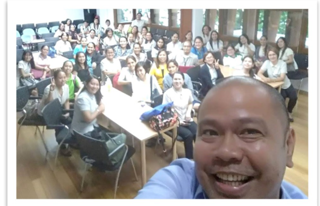
Group photo during the PRB and Design Thinking Seminar inside the QCPL Conference Room